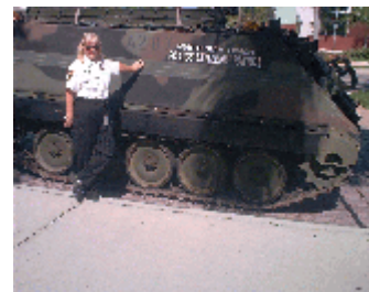
New Volunteer Vehicle? No! Part of equipment display at NACOP meeting (See next Page)