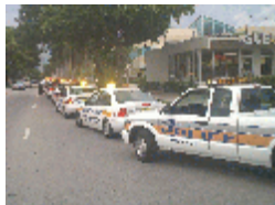
Volunteer Vehicle Parade at NACOP meet

their volunteer programs. They learned that although some departments have larger numbers of volunteers, very few cities used their volunteers for as many duties as Clearwater.