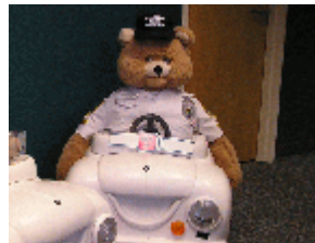
Elvis' New Outfit